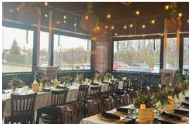
GARDEN ROOM (SEATS 50 PEOPLE)

$1500 FOOD & BEVERAGE MINIMUM EXPENDITURE