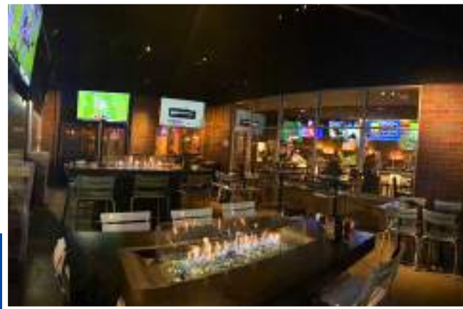
FIRESIDE ROOM (SEATS 50 PEOPLE)

$1,000 FOOD AND BEVERAGE MINIMUM EXPENDITURE